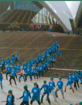
Power Shift opera House Dance