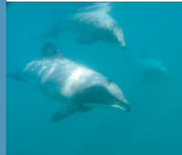
Hector's Dolphins