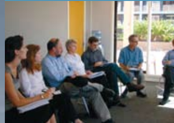
Annual Wentworth Group Meeting