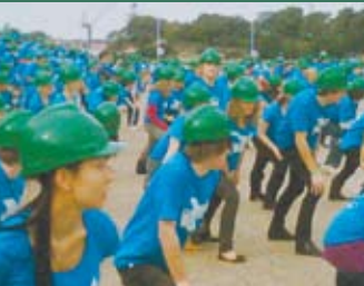
Power Shift opera House Dance