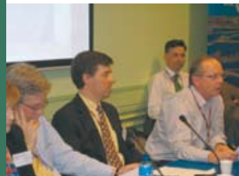
Members of the Council at COP14, Poznan

local community engagement including door-knocking in Parramatta, and a creative dance action on the steps of the Sydney Opera House. Many of the trainings were modelled on 'Camp Obama' which trained youth organisers before the US election. AYCC is also planning the first ever national youth climate referendum in October 2009, to be held through schools, TAFEs and Universities right across Australia.